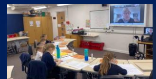
Photo Gallery – don't forget to follow us on Twitter!